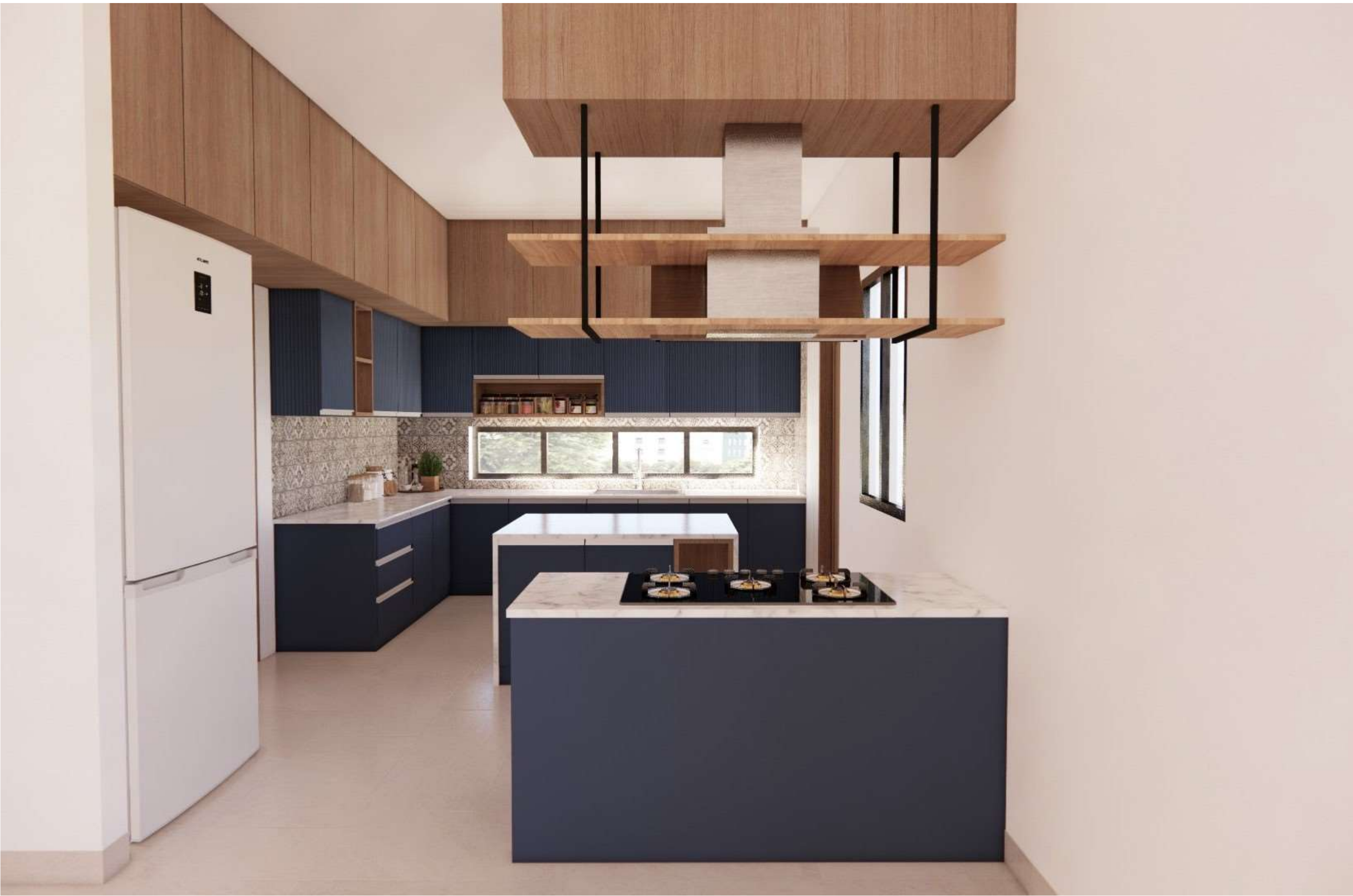
Kitchen Look and FEEL