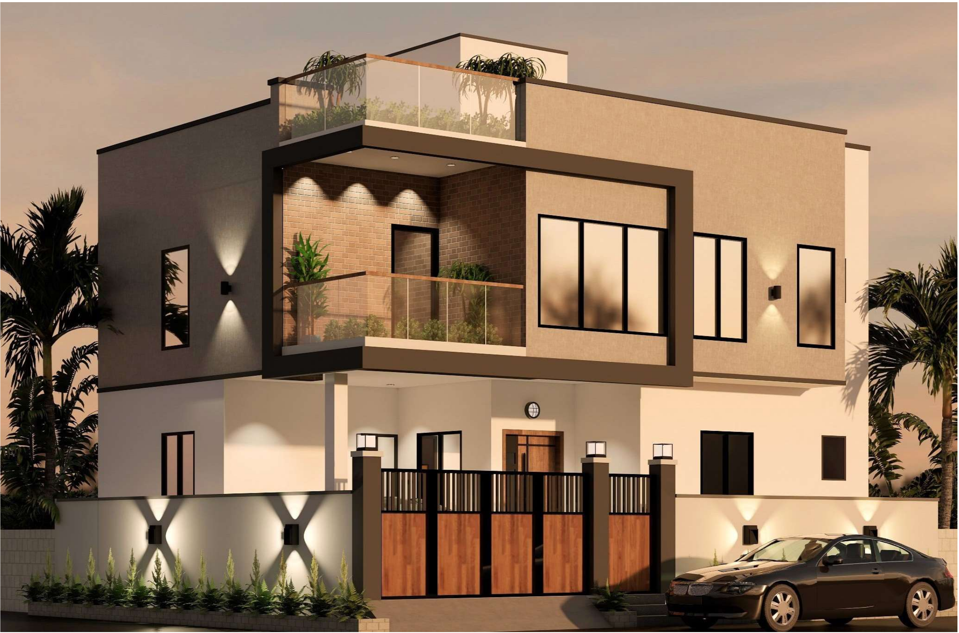
FRONT ELEVATION - Evening Scape View