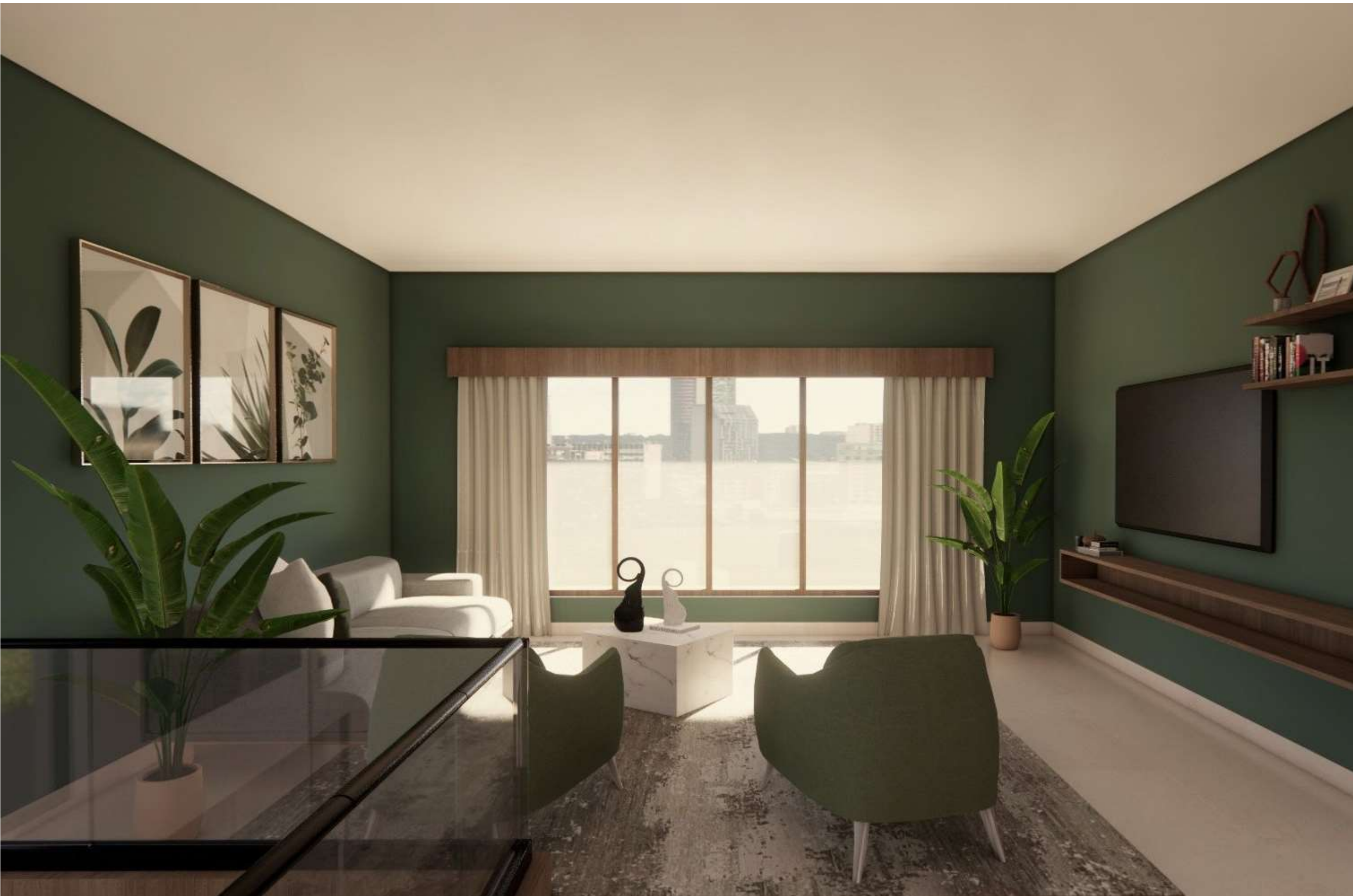
Living Space Look and FEEL