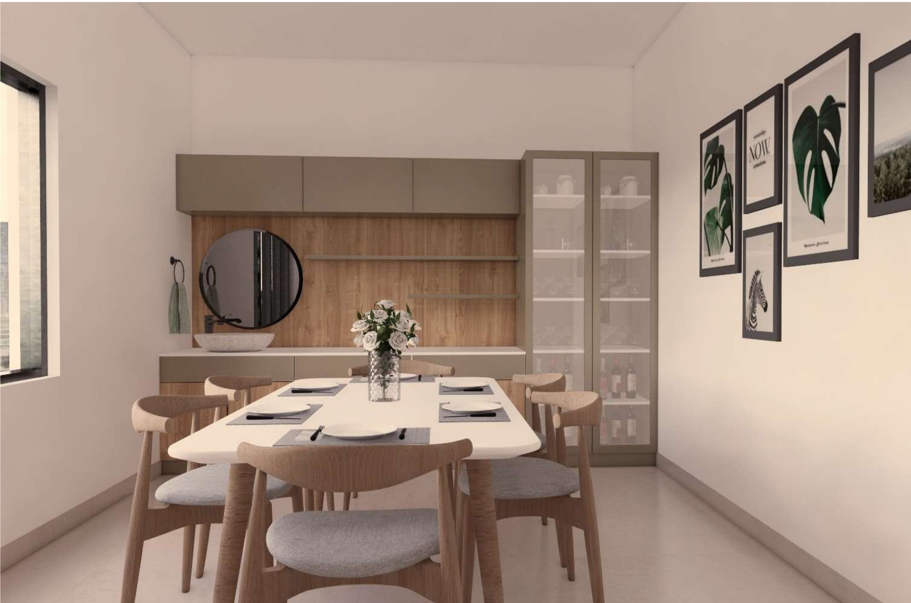
Dining Space Look and FEEL