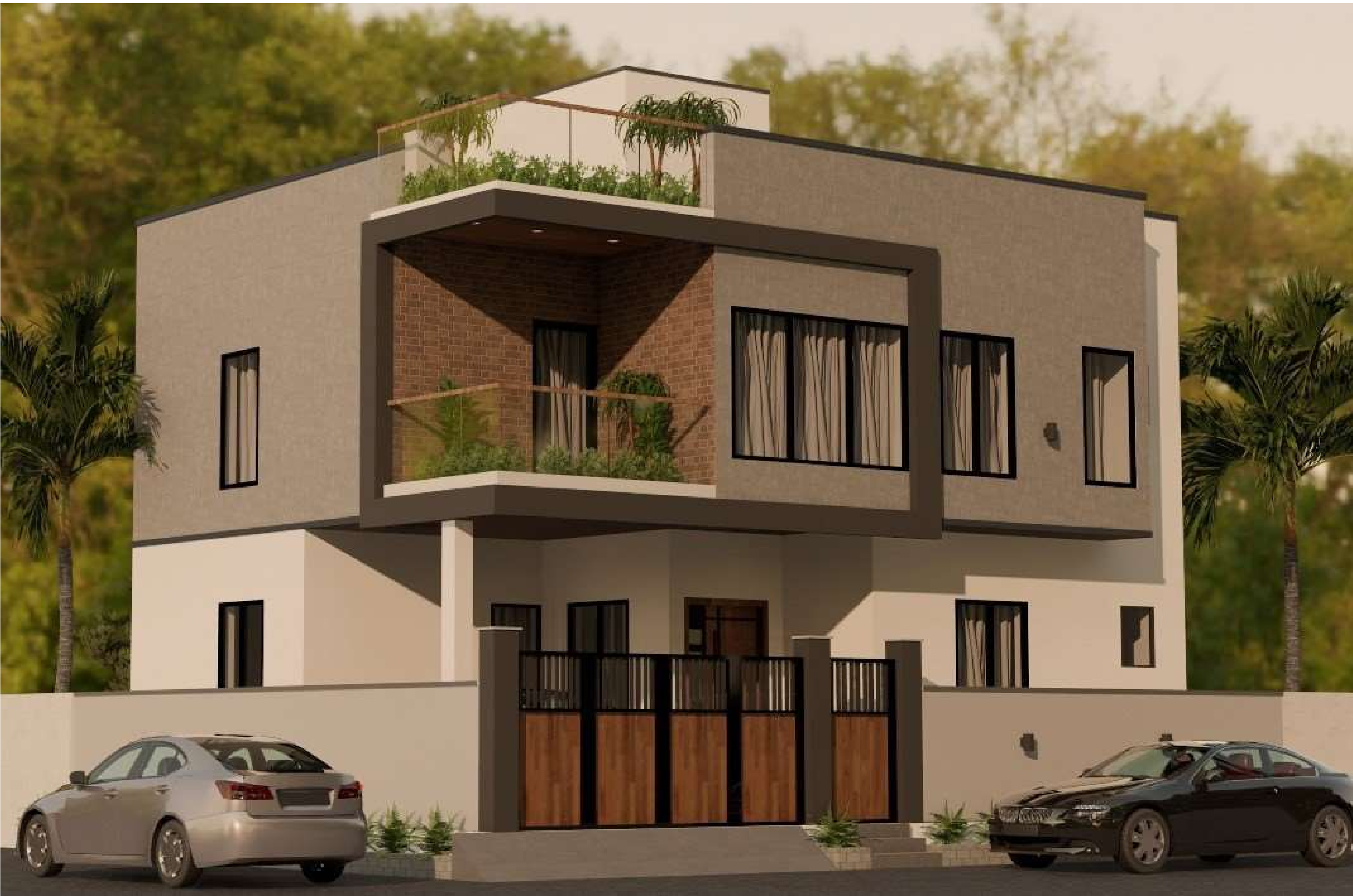
FRONT ELEVATION - Day View