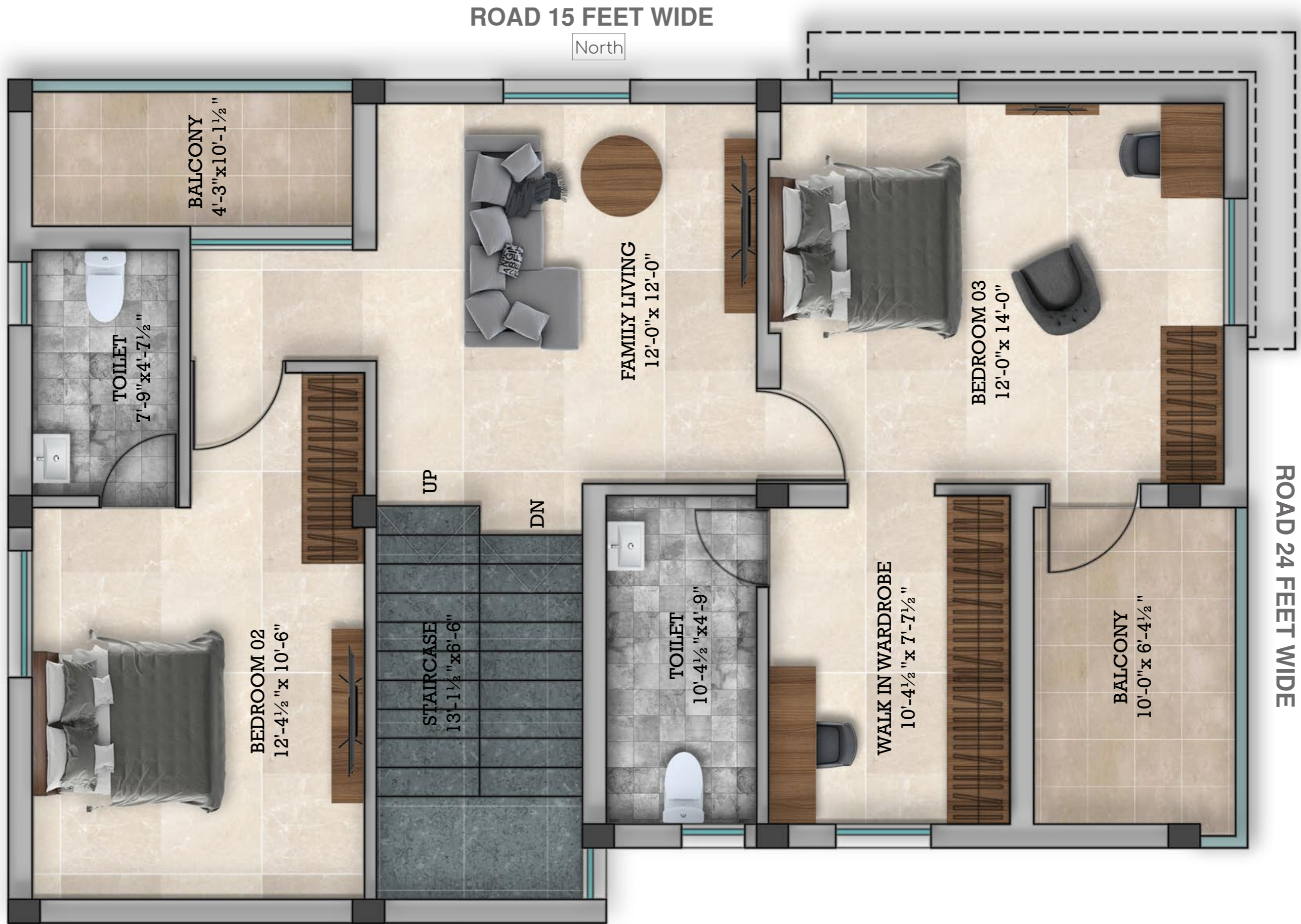
FIRST FLOOR PLAN SQUARE 2 CONSTRUCTION